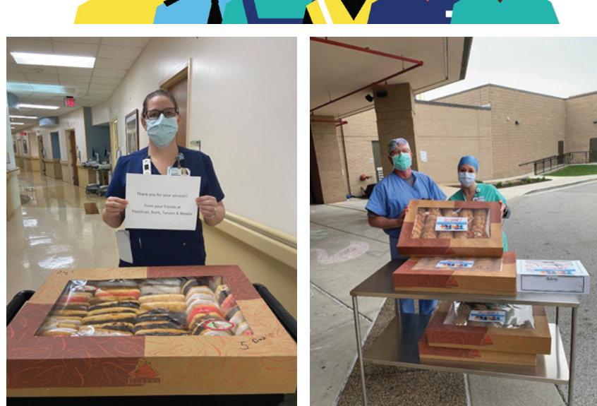
Union Hospital, Terre Haute, IN Terre Haute Regional Hospital